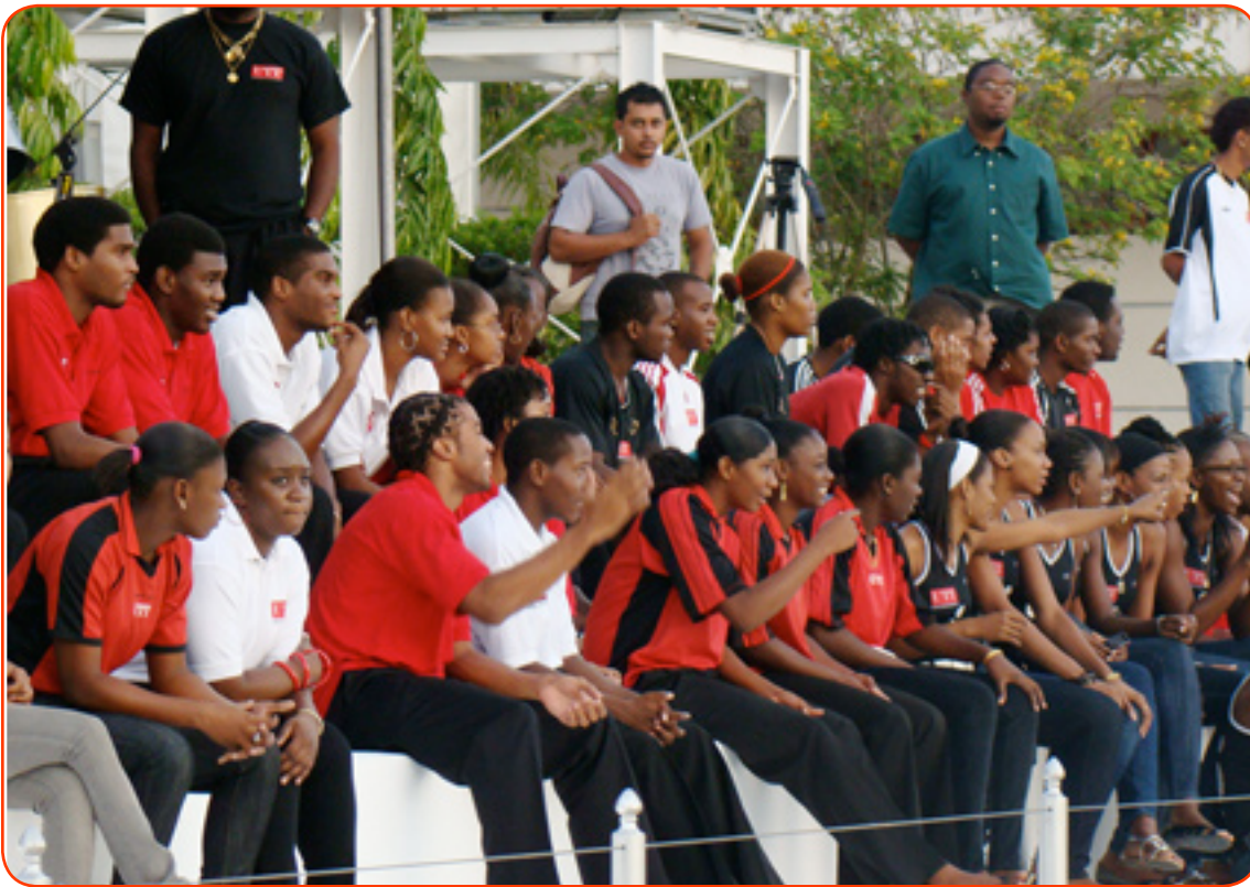
Cross-section of scholarship students at the opening of UTT O'Meara Sporting Facility.