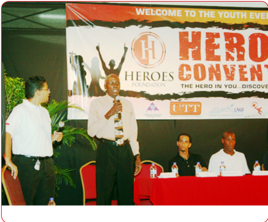
Heroes Convention scores big with volunteers.

Skits put on by student groups were well received and the interactive games available throughout the Convention provided many light hearted moments.