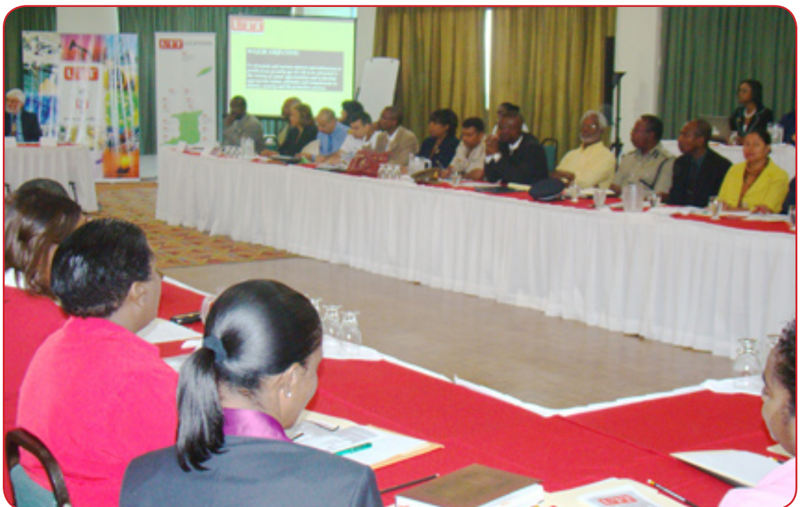
Participants at the Stakeholders' Consultation held at the Crowne Plaza.

the police, prison and fire services and the defence force were in attendance. Leaders of the cadets, scouts, girl guides, Civilian Conservation Corps, etc. also participated.