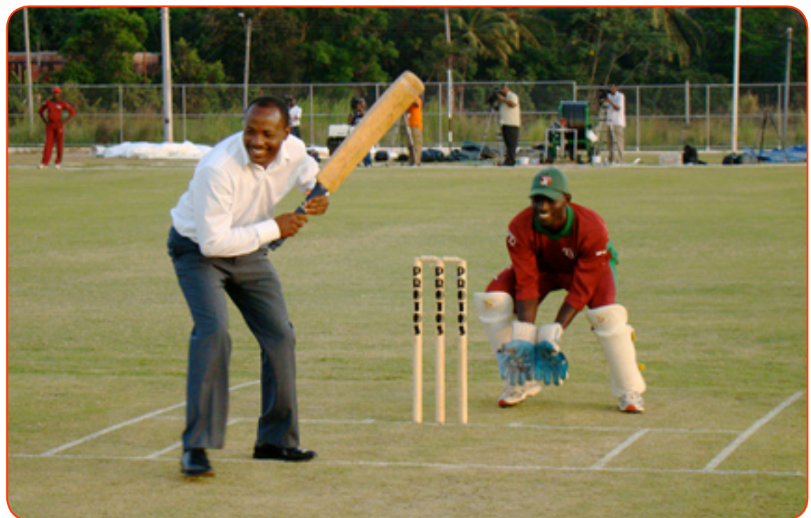
Cricket Icon Brian Lara bats the first ball at the opening.

athletic, of the 130 scholarship students of the University. These students are pursuing their tertiary education in their chosen field, while at the same time, receiving the opportunity to train in their particular athletic