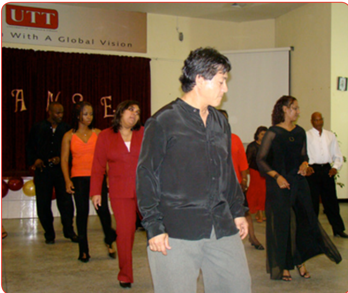
Crosssection of dancers showing off basic steps of Latin dance at the Pt. Lisas Campus.