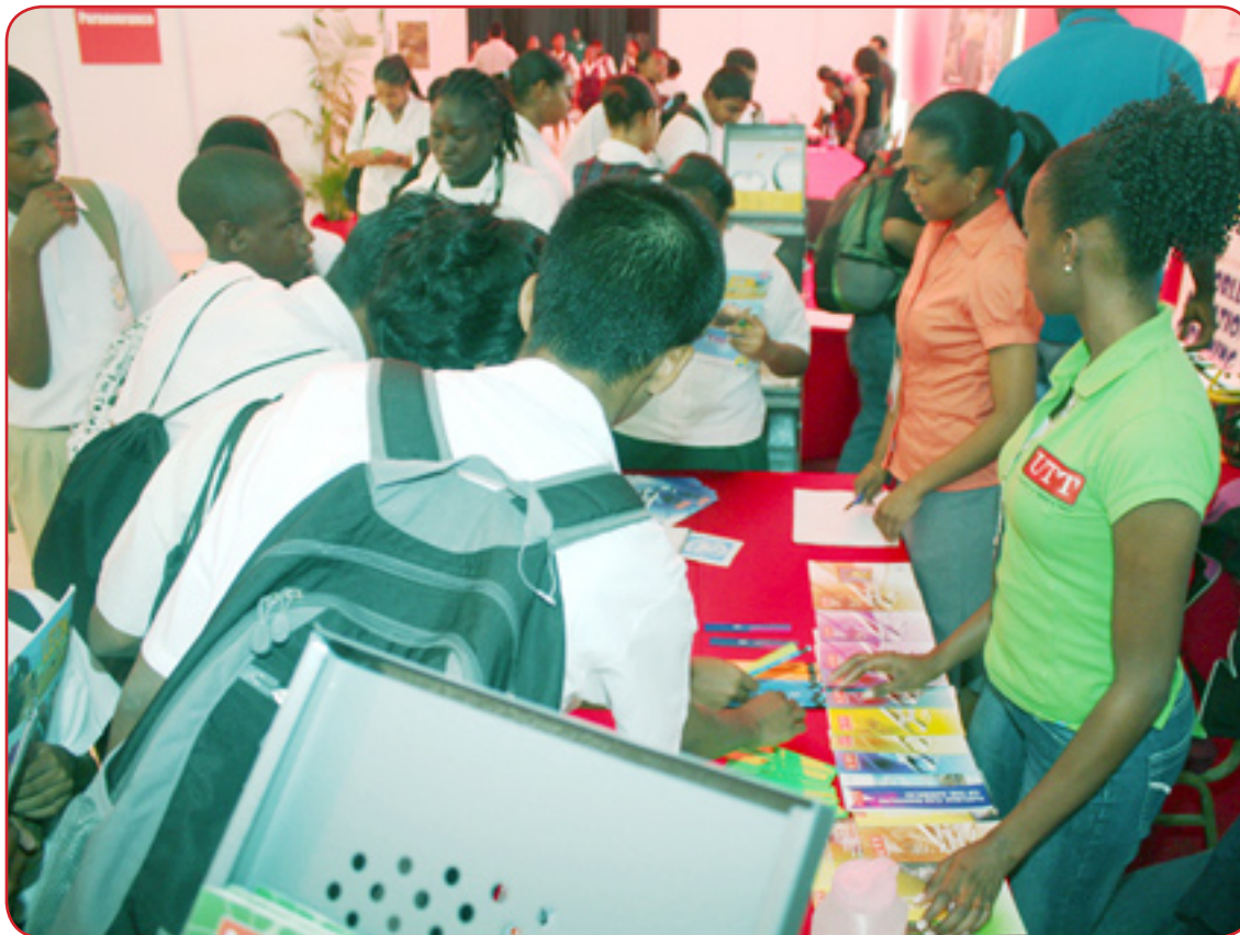
Students interested in volunteerism at Heroes Convention.