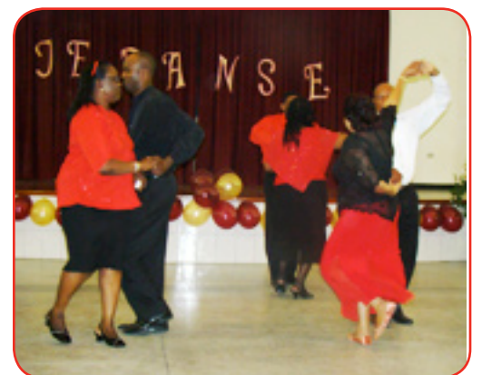
Dancers go through their paces.