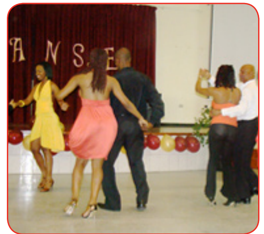
Latin dance exhibition at Pt. Lisas.